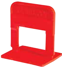
1.5mm Red Clip Tiles 5mm-14mm Cartons of 450 & 1800

You've tried the rest, now use the best!