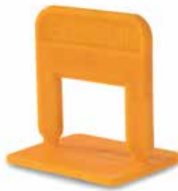
3mm Orange Clip Tiles 5mm-14mm Cartons of 450 & 1800