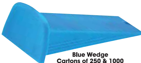
Blue Wedge Cartons of 250 & 1000