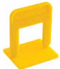
3mm Yellow Clip Tiles 11mm-20mm Cartons of 400 & 1600